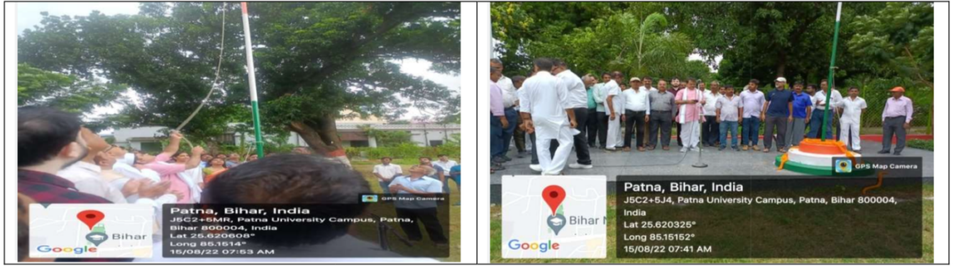
Flag hosting ceremony by College Principal on 15/08/2022