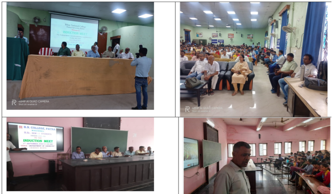
Induction Meet held at B. N. College, Patna