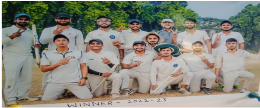
B. N. College was winner of Cricket Competition, 2022-23